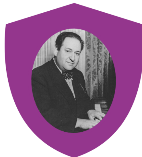
ERICH WOLFGANG KORNGOLD