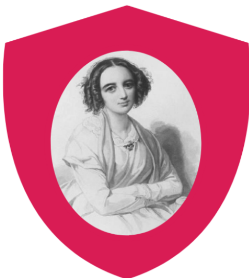
FANNY MENDELSSOHN HENSEL